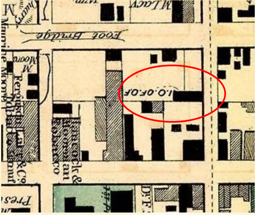
Blackford's 1860 map shows the Odd Fellows Hall. It sat on twelfth Street between Church & Main. It also appears on Grays' 1877 map.