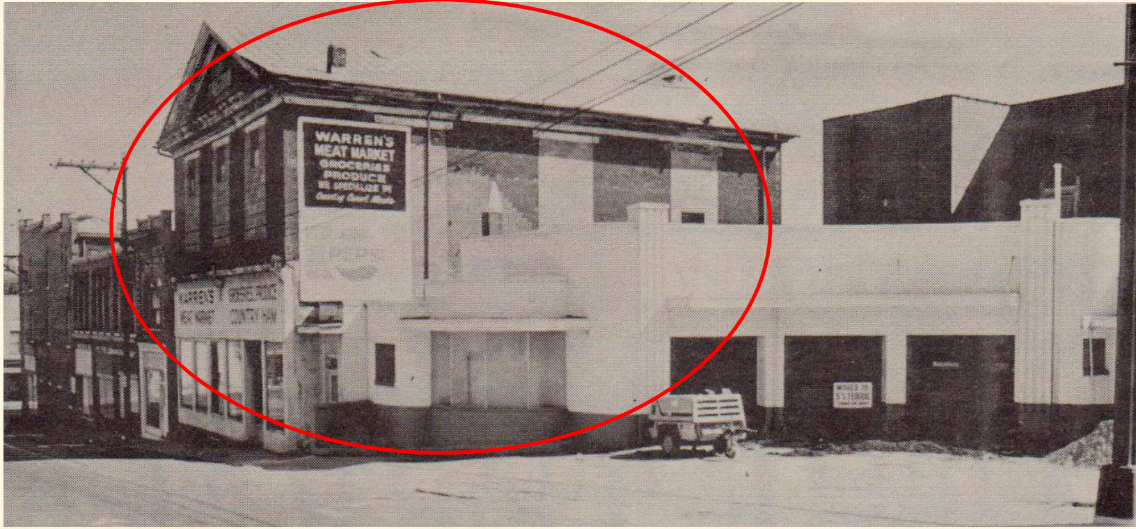
Odd Fellows Hall circa 1985.