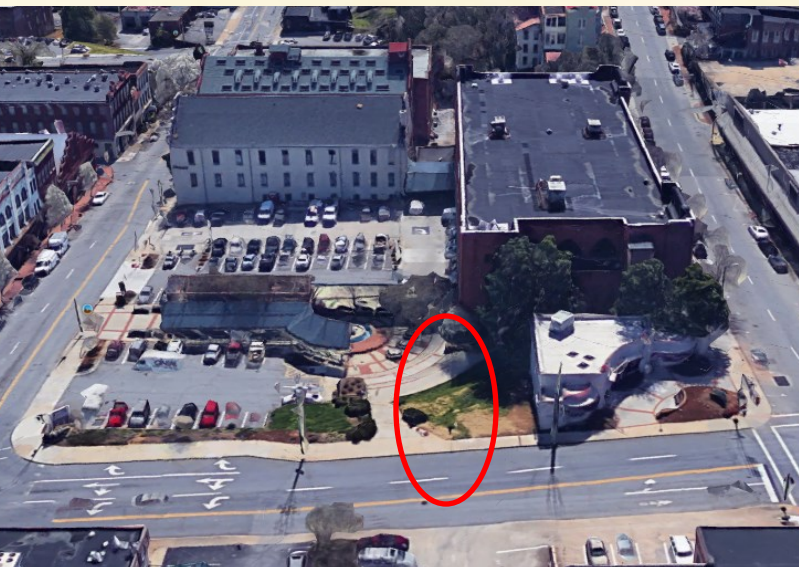
The Odd Fellows Hall was located behind the current Lynchburg Visitor Center. The Community Market is to the left.